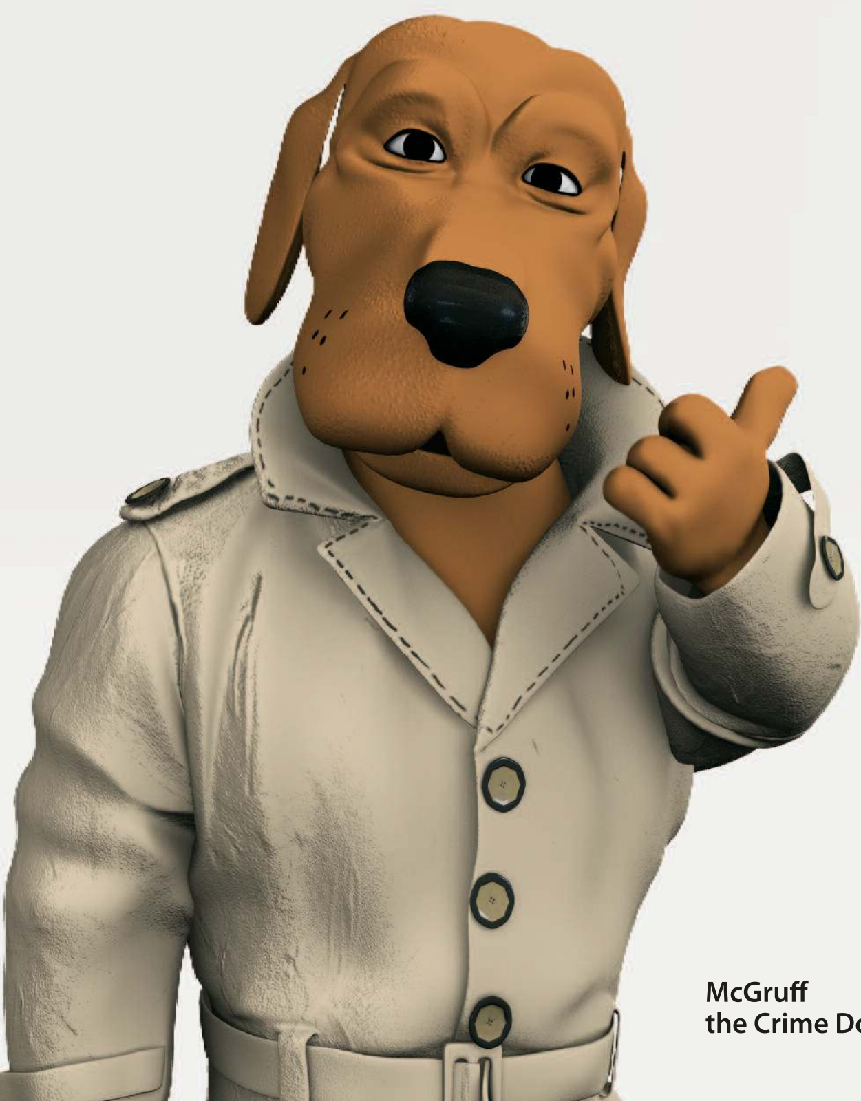
McGruff the Crime Dog®

To learn more about cybercrime, visit ncpc.org or contact your local law enforcement agency.